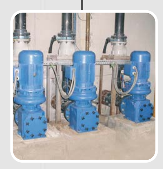
E.g. circulation pumps, attractions or blowers.

Suitable for use in filters of different sizes in private pools.