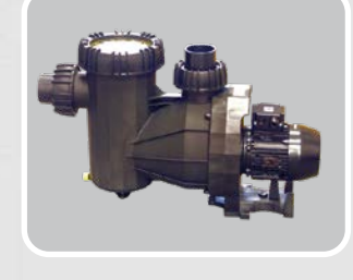
E.g. three-phase circulation pumps, attractions or blowers.

E.g. massage nozzles, sample water pumps, dosage pumps, small UV systems, lighting etc.