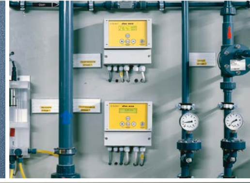
Rocco Forte Hotel Villa Kennedy, Frankfurt/Germany