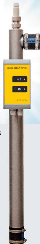
dinUV CLEAR 75

Germs and microorganisms that pose a risk to health are physically inactivated by means of ultraviolet light. Only a minimum chemical depot disinfection is required in the pool itself.